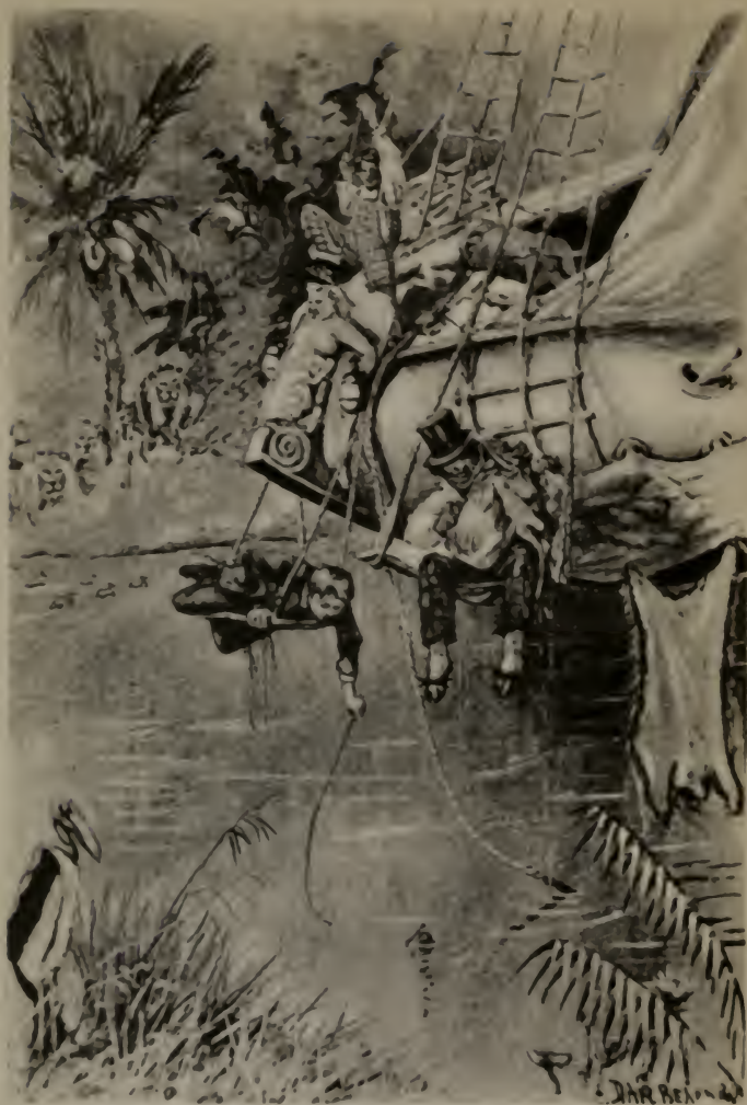
We Caught a Lot of the Nicest Fish You Ever See